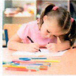
do my work