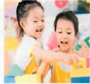
share and take turns