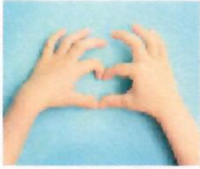
use gentle hands