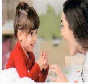
use my words