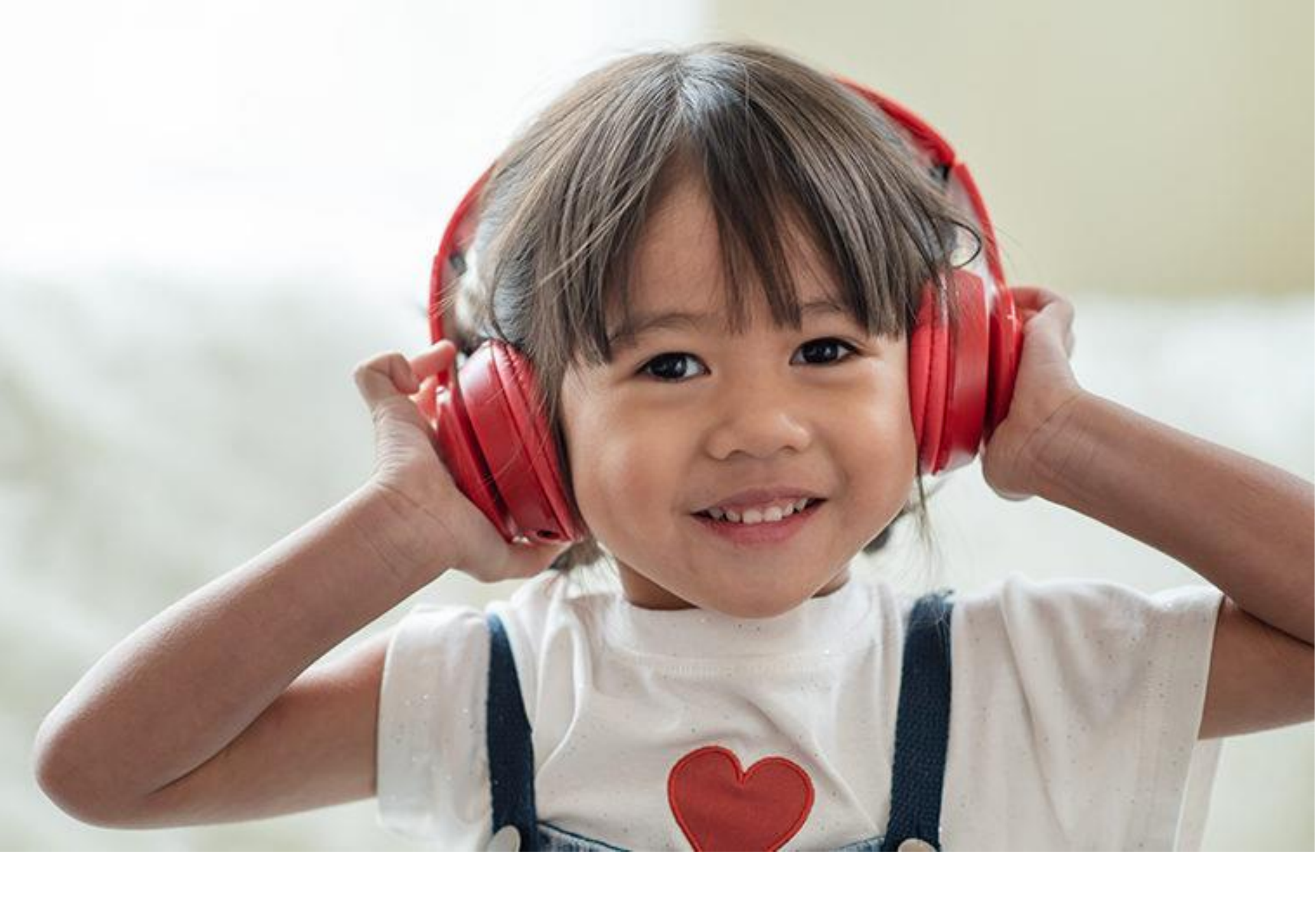
If the noises are too loud, I can cover my ears with my hands or use headphones to block out some of the noise.