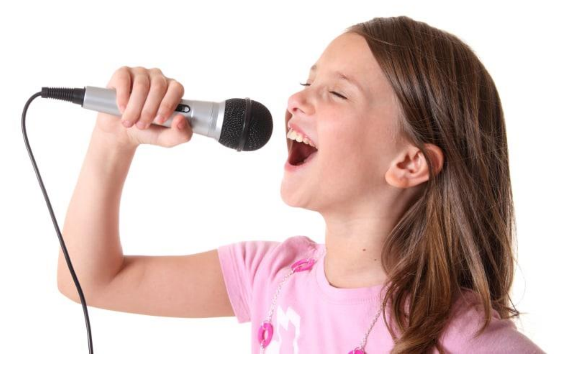
I can also sing my favorite song like "Wheels on The Bus" while I use the bathroom. This might help make the public bathroom less scary.